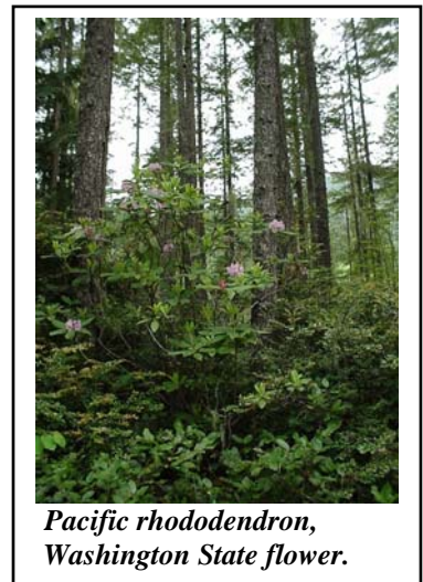
Pacific rhododendron, Washington State flower.